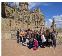
Study Abroad Madrid Summer 2016

Study Abroad (Madrid, Mallorca, WIP, Peru, and many other options!)