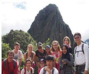
Study Abroad Lima 2016

FOR COMPLETE INFORMATION SEE ACADEMIC ADVISOR OR VISIT WWW.CLA.PURDUE.EDU/SLC/L/SPANISH/